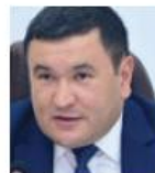
Jurabek Mirzamakhmudov, Government of Uzbekistan